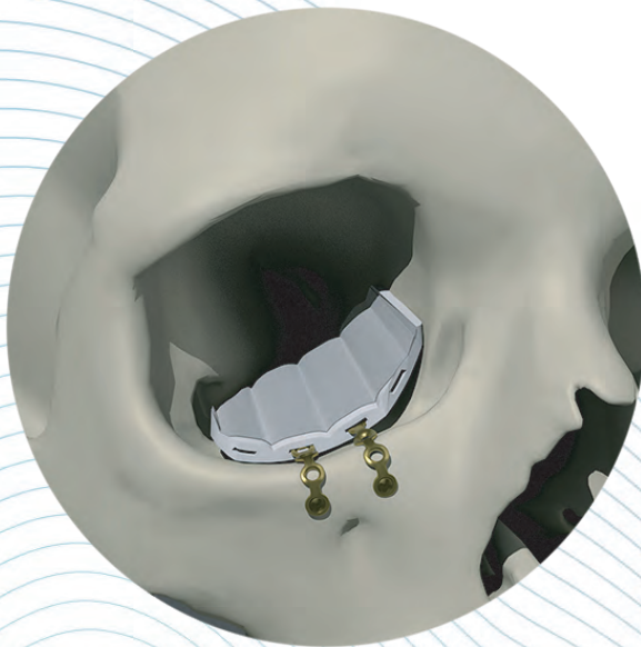
Plates Shown. Not Included