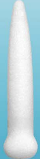
Small / Large