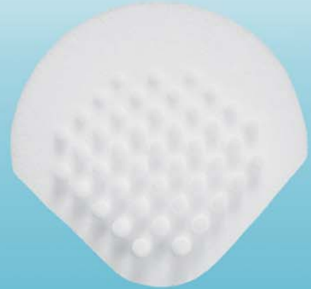
SP Temporal Flex Grid