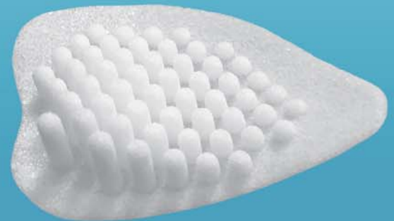
Temporal Flex Grid